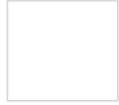
M1 - White