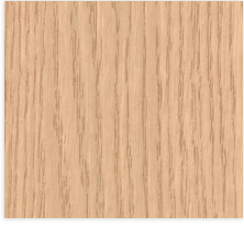
D1 - Whitened oak