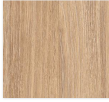
D2 - Amber oak