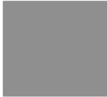
M - Metallic