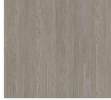
D5 - Grey wood