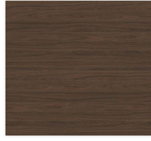
D4 - Dark walnut