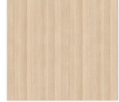
D3 - Sand Ash