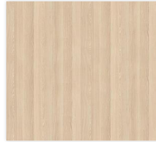
D3 - Sand Ash