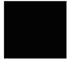
A - Black