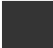
T1 - Dark grey