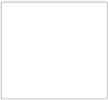
E - White