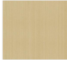
V1 - Ash