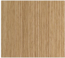
AA - Oak