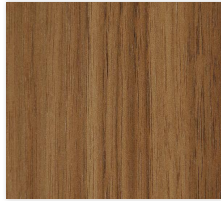
RR - Walnut