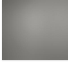
H17 - Grey