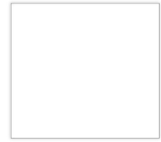
M1 - White