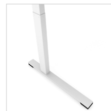
2 level column: 645-1145 mm